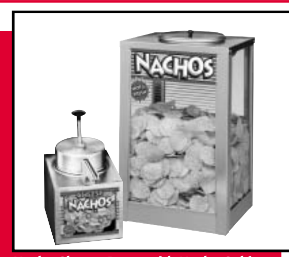
Nacho Cheese Pump with Nacho Cabinet